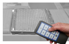
Play detector with remote control