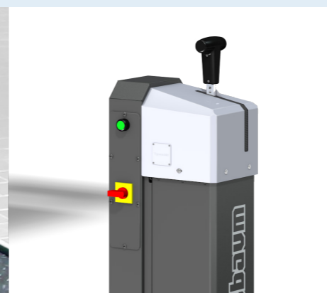
Very flat construction: Ideal for very low clearance vehicles