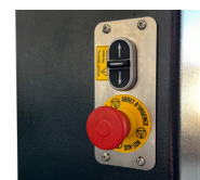
Control unit on both columns