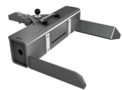
Wheel-fork adapter for SLH 5500