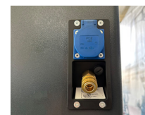
Energy Set with pressured Air and 230 V socket