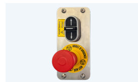
Control unit on both columns