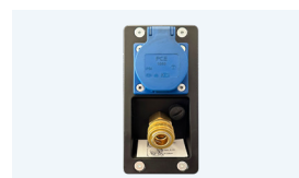
Energy Set with pressured Air and 230 V socket