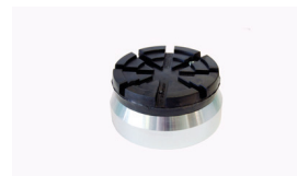
Height adapter 44 mm