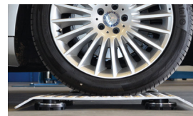
Drive-on plates (4 units)