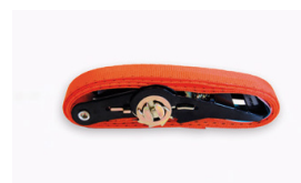
Lashing straps (2 units)