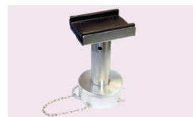
U-form adapter 150-233 mm