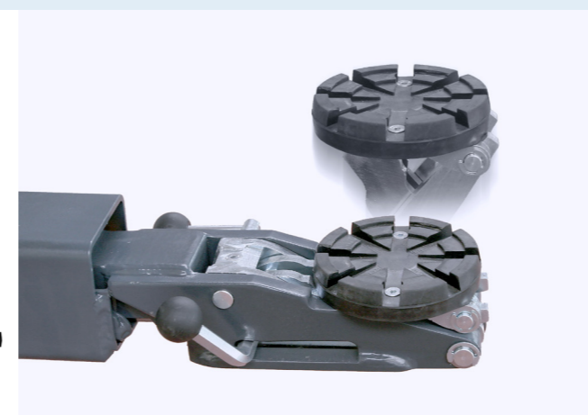
SC (Sports car arms): extremely flat construction. Very sturdy, made of solid material. Especially suitable for very low and wide sports cars.