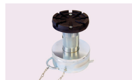
Height adapter 155-245 mm