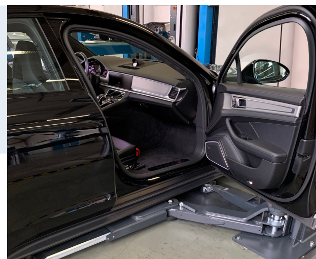
Wide opening of the vehicle's front doors

Full range of plug in adapters available from 3500 kg. The perfect match for every gasoline, hybrid or fully electric vehicle.