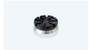
Height adapter 44 mm*