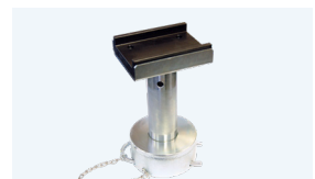
U-form adapter 150-233 mm*