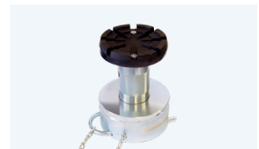
Height adapter 155-245 mm*