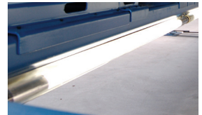
Lighting 4 or 6 tubes LED